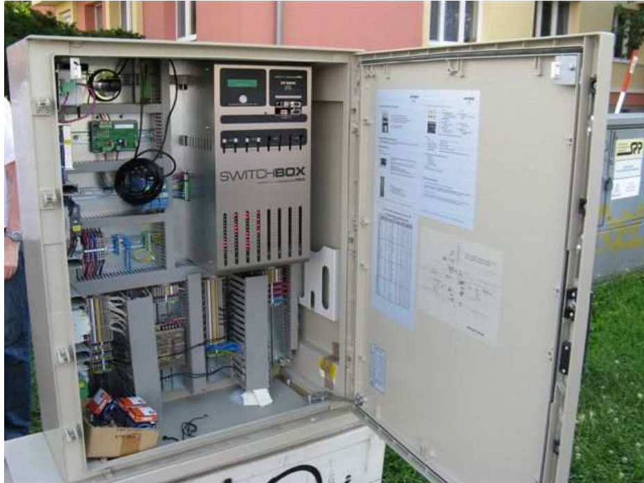
Figure 3: Tram signal priority equipment installed at the Pekna Cesta intersection along the Racianska Corridor

With the availability of funds in this Component, the Steering Committee in consultation with stakeholders at a November 2013 workshop made a decision to finance an additional activity to improve the accessibility to public transport for the people with disabilities. Using information from consultations with the ECB, City Hall, DPB and NGOs dealing with disabled citizens, bus stops for pilot modifications were identified including the bus stop area under the Most SNP. The Project has provided documentation with recommendations for the improvement of this bus stop.