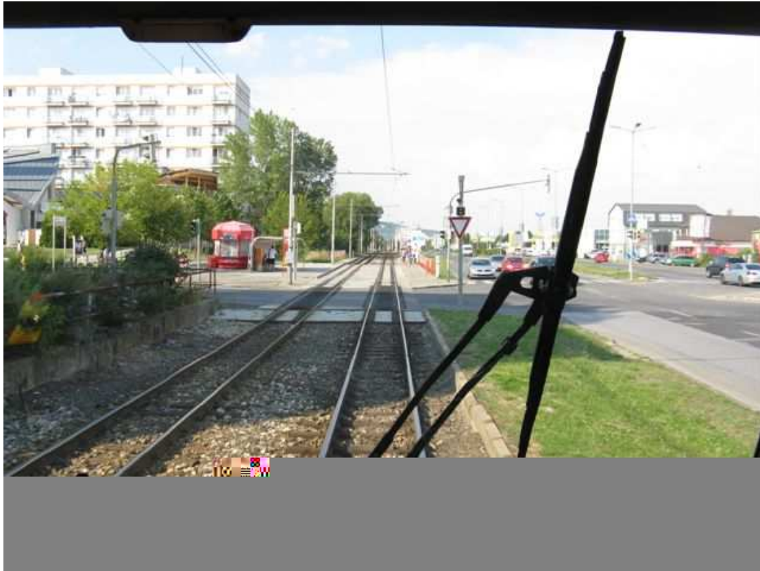
Figure 2: Pekna Cesta Tram stop along the Racianska Corridor

The success of the pilot installations has also catalyzed the Municipality's interest in increasing their investments into further improvements for tram efficiency and developing some of the trams stops into a more passenger friendly area. Pipeline investments under consideration with secured funding include: