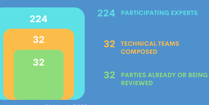
as at 31 March 2025

The secretariat's ability to meet the mandated criteria for team composition is hindered by the increasing number of experts from developed countries declining to participate owing to limited funding.