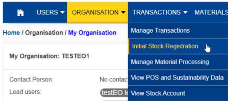
Fig 1. Initial Stock Registration menu option

When the section opens the User can then add the initial stock details by clicking on the 'Register Initial Stock' button.